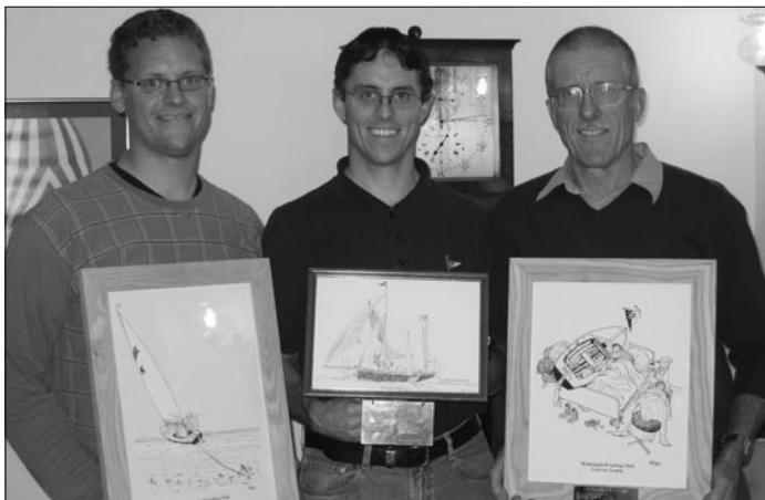
The Fish's net the Cartoon trophies